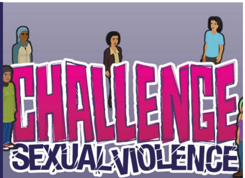
Image: www.challengesexualviolence.org , newly launched home to What It Is. digital game challenging sexual violence against youth

"[The game content is relevant] because I know people in that situation." (Youth focus group participant, informing design of the digital game, What It Is. )