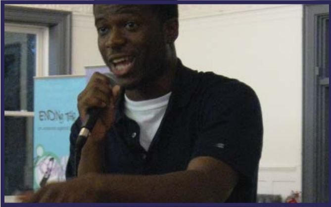
Image: Performance by a member of Parkdale Street Writers at the Bouncing Back event