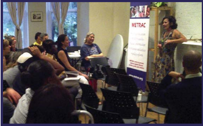
Image: Don't Need Saving video launch event at Native Women's Resource Centre of Toronto